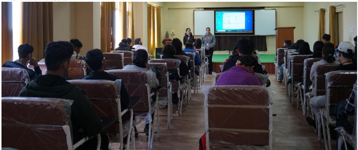
Sessions on mental health and stress management