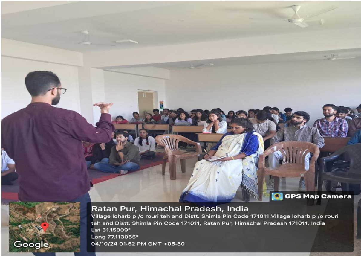
Interaction Session 2