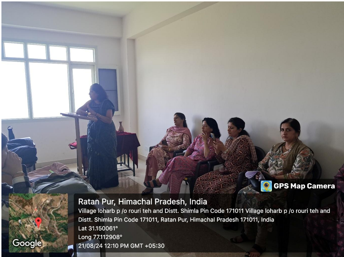
Girl Students being mentored regarding their grooming, physical and mental health, rights and other social issues they ought to be aware of.

Ratan Pur, Himachal Pradesh, India Village loharb p /o rouri teh and Distt. Shimla Pin Code 171011 Village loharb p /o rouri teh and Distt. Shimla Pin Code 171011, Ratan Pur, Himachal Pradesh 171011, India Lat 31.150061° Long 77.112908° 21/08/24 12:10 PM GMT +05:30