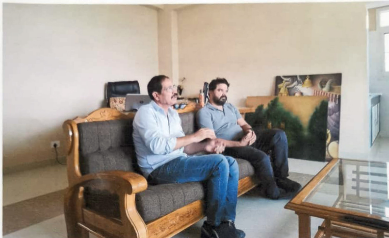
Annexure 1. Photographs from the workshop