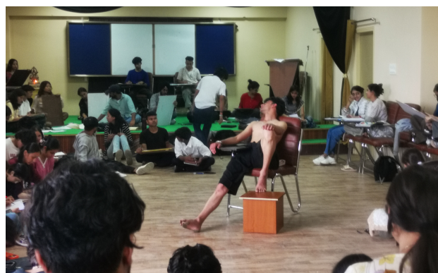
Images from the workshop